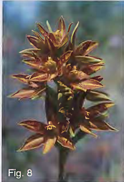
Figures 5-8. Fig. 5. Thelymitra magnifica (photograph by Jeff Jeanes). Fig. 6. Thelymitra dedmaniarum (photograph by Andrew Brown, Department of Environment and Conservation, Western Australia). Fig. 7. Thelymitra yorkensis (photograph by Andrew Brown, Department of Environment and Conservation, Western Australia). Fig. 8. Thelymitra stellata (photograph by Andrew Brown, Department of Environment and Conservation, Western Australia).